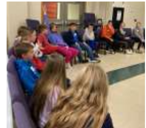
Our Youth at Confirmation Jubilee October 16, 2024 Lutheran Church of Peace Platteville